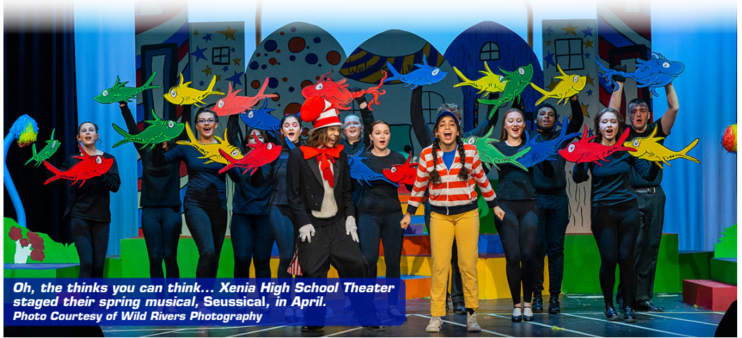
Oh, the things you can think... Xenia High School Theater staged their spring musical, Seussical , in April.