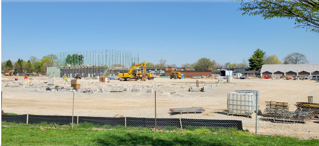
A view of the construction site in April 2023, with walls going up for the regulation gym in the background and the start of the Academic Wing visible in the foreground.

Now that the weather has warmed, the work to build the new Warner Middle School is moving ahead, with something new to see on the site each week. For those interested in a little more detail, here is a quick look at the projects to watch over the spring and summer!