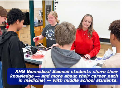
XHS Biomedical Science students share their knowledge — and more about their career path in medicine! — with middle school students.