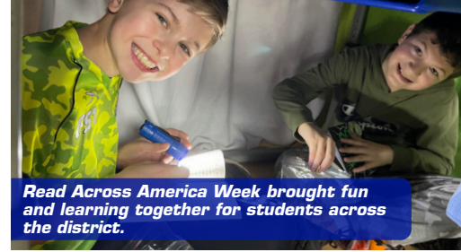
Read Across America Week brought fun and learning together for students across the district.