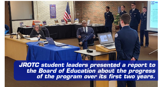
JROTC student leaders presented a report to the Board of Education about the progress of the program over its first two years.