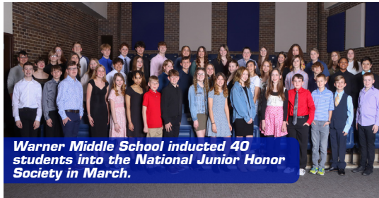
Warner Middle School inducted 40 students into the National Junior Honor Society in March.