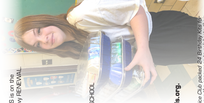
PHOTO: The Warner Middle School IMPACT Service Club packed 24 Birthday Kits for students and families at Warner that might not have the resources to celebrate their birthdays! Kits include a cake mix, candies, and a card.

Looking for more important dates? Find the most current calendar at XeniaSchools.org .