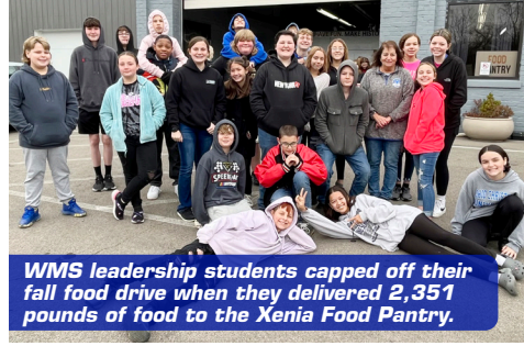
WMS leadership students capped off their fall food drive when they delivered 2,351 pounds of food to the Xenia Food Pantry.