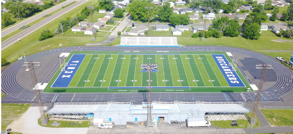
A view of Doug Adams Stadium from above.

The district's newest construction project is one that has been on the minds of parents and student-athletes, a renovation at Doug Adams Stadium to include lighting, bleachers, press box, and parking.