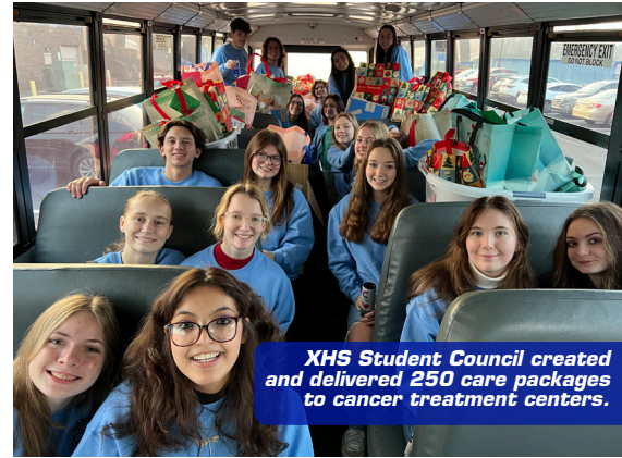
XHS Student Council created and delivered 250 care packages to cancer treatment centers.