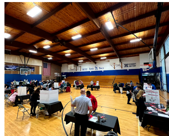
7th and 8th grade students at Warner Middle School participate in the Real Money, Real World experience as part of the XCS financial literacy learning program.