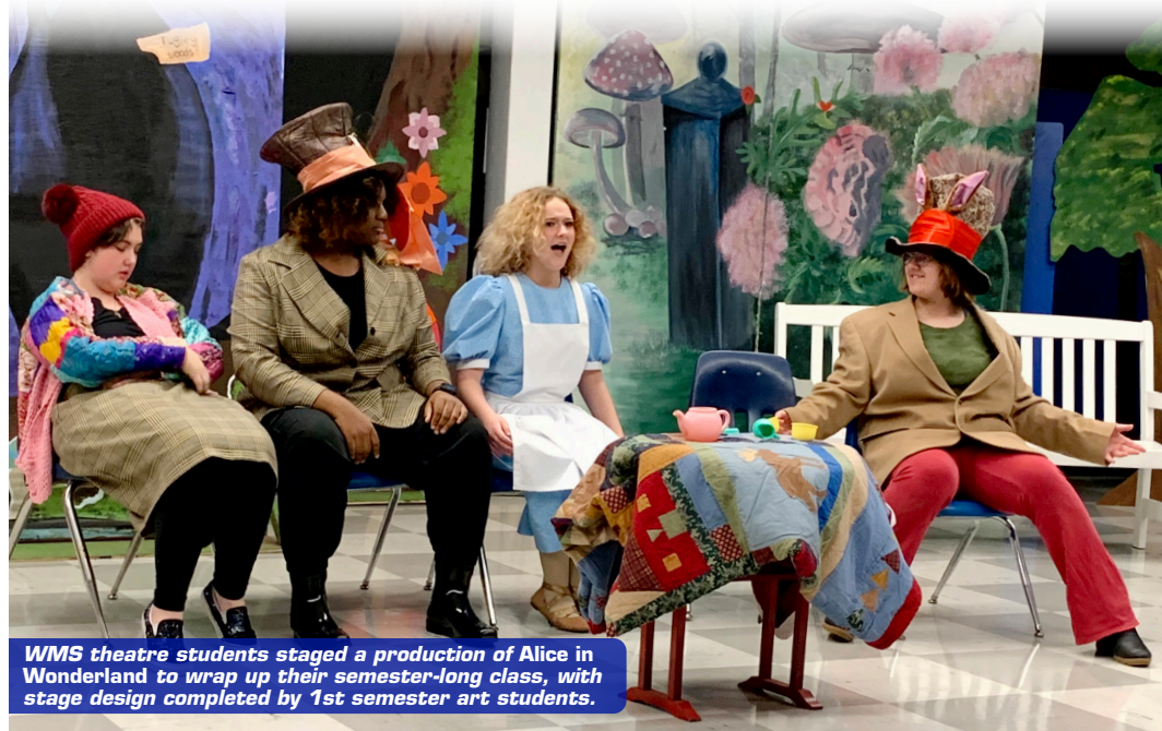
WMS theatre students staged a production of Alice in Wonderland to wrap up their semester-long class, with stage design completed by 1st semester art students.