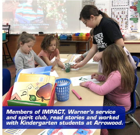
Members of IMPACT, Warner's service and spirit club, read stories and worked with Kindergarten students at Arrowood.