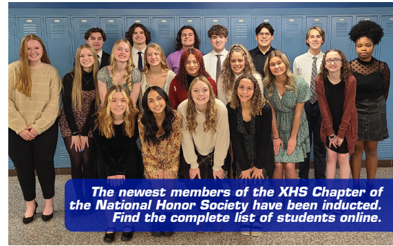
The newest members of the XHS Chapter of the National Honor Society have been inducted. Find the complete list of students online.